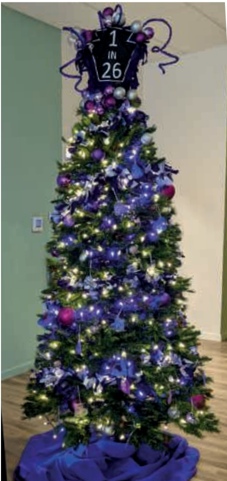
The EAWCP participated in a Christmas in July event, hosted by the Mall at Robinson, with an interactive tree display.