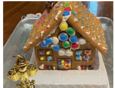
Families who participated in the Virtual Holiday Party received a gingerbread house kit to build as a family.

Visit www.eawcp.org or contact one of our offices: