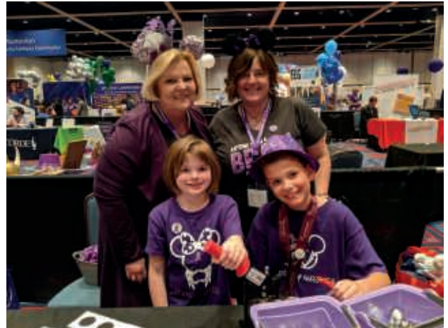
In addition to sending staff to Epilepsy Awareness Day and Expo at Disneyland, we also sponsored a family to attend the expo and enjoy Disneyland through our Zonne Fund.