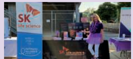
SK Life Science hosted a resource table at the 2021 Harrisburg Senators Run/Walk for Epilepsy.

Visit www.epilepsyallianceamerica.org/steps-tool for a copy of this tool today!