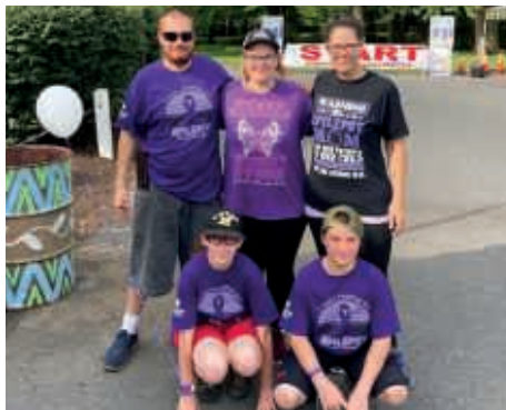
Participants in Harrisburg were excited that the Harrisburg Senators Run/Walk for Epilepsy was held in-person this year.