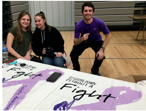
Students at Robert Morris University held a 3-on-3 basketball tournament to help raise funds and epilepsy awareness in their local community.