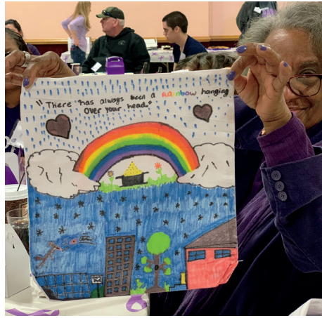
An attendee at the 2019 Purple Party shows the craft she completed.