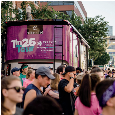
The 1 in 26 Tour RV made its final appearance at the 2019 Pittsburgh Run/Walk.