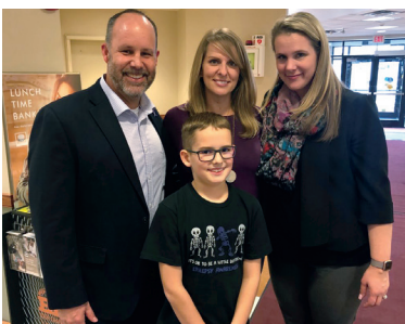
The Humphreys family hosted a dress down day at Central Penn College in support of their son.