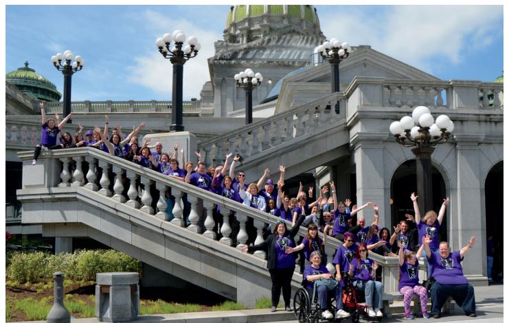
This group of stellar advocates shared their epilepsy stories at the Capitol last spring. Due to the coronavirus, this year we had to advocate for epilepsy support virtually.