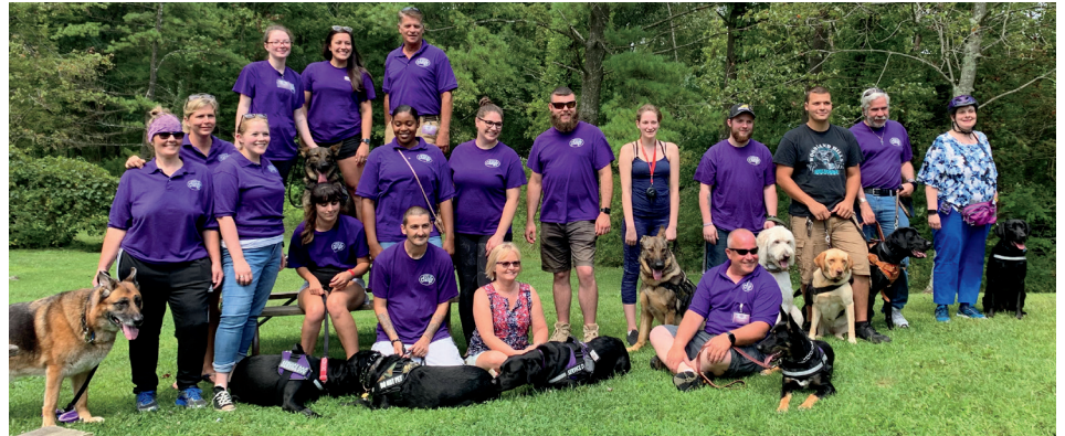
Oscar recipients, new and old, met to enjoy the day at a picnic at Settlers Cabin in September.

Visit www.eawcp.org , email staff@eawcp.org , or contact one of our offices: