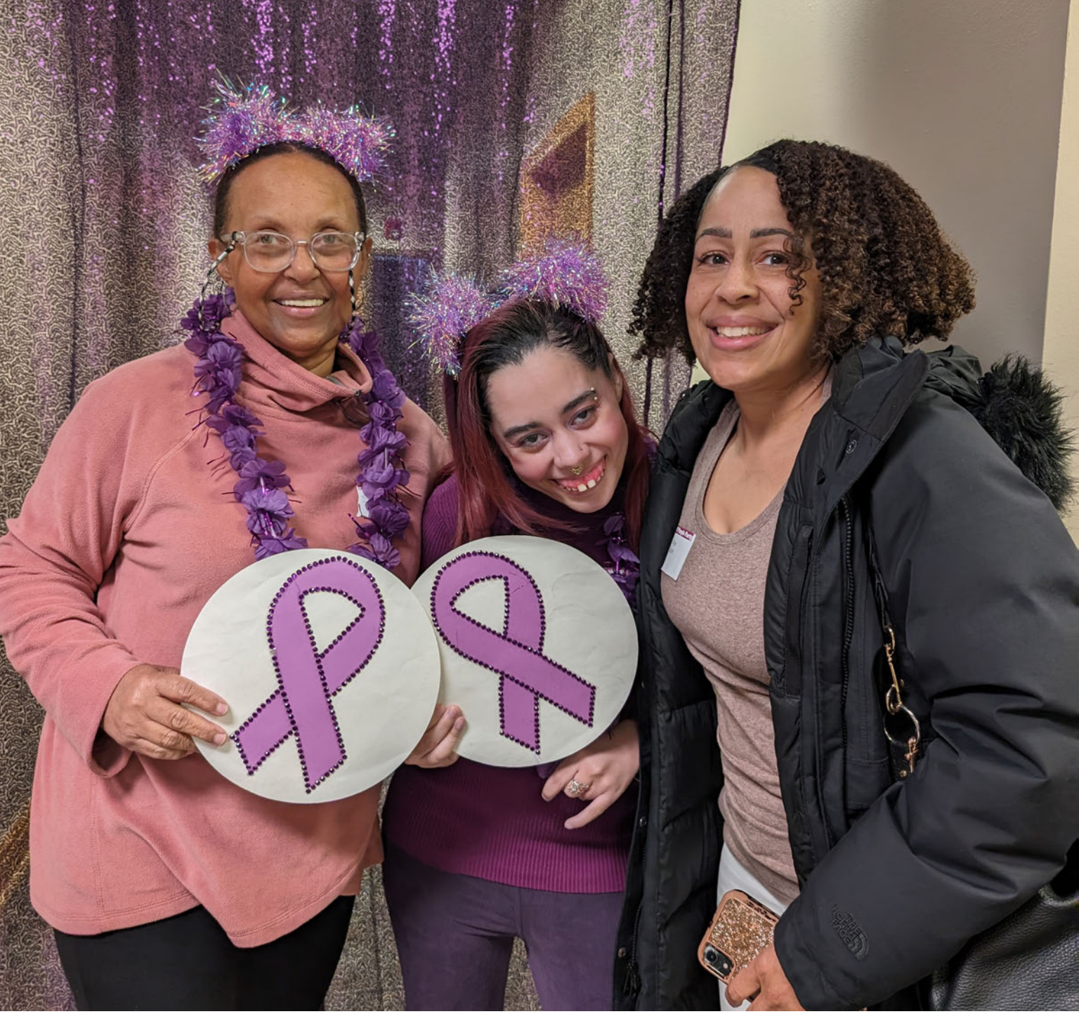
The annual Purple Party includes a photo booth where participants can take a photo that they are then encouraged to share on social media to help raise epilepsy awareness.