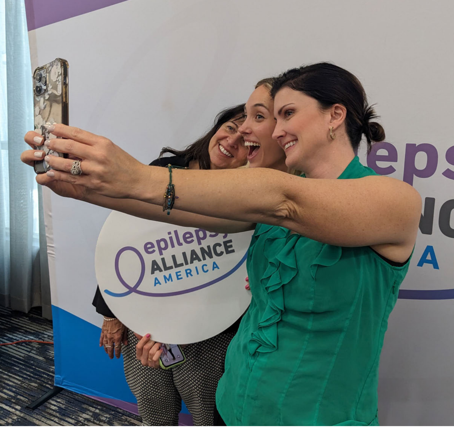
At the Epilepsy Alliance America Member Organization Meeting in North Carolina, EAWCP staff attended a session focused on using social media platforms like LinkedIn to promote both themselves and the EAWCP. Pictured here are staff from other EAA member organizations.