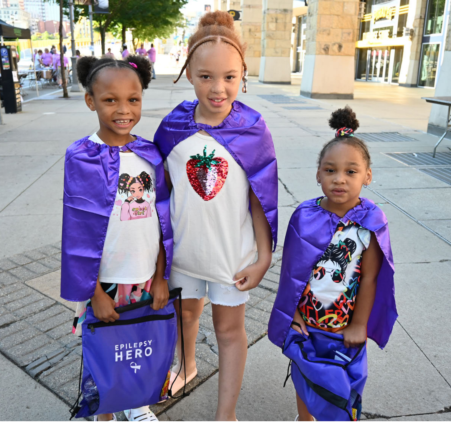
Some of the younger Pittsburgh Family Fun Run/Walk for Epilepsy participants dressed up for the walk as Epilepsy Heroes.