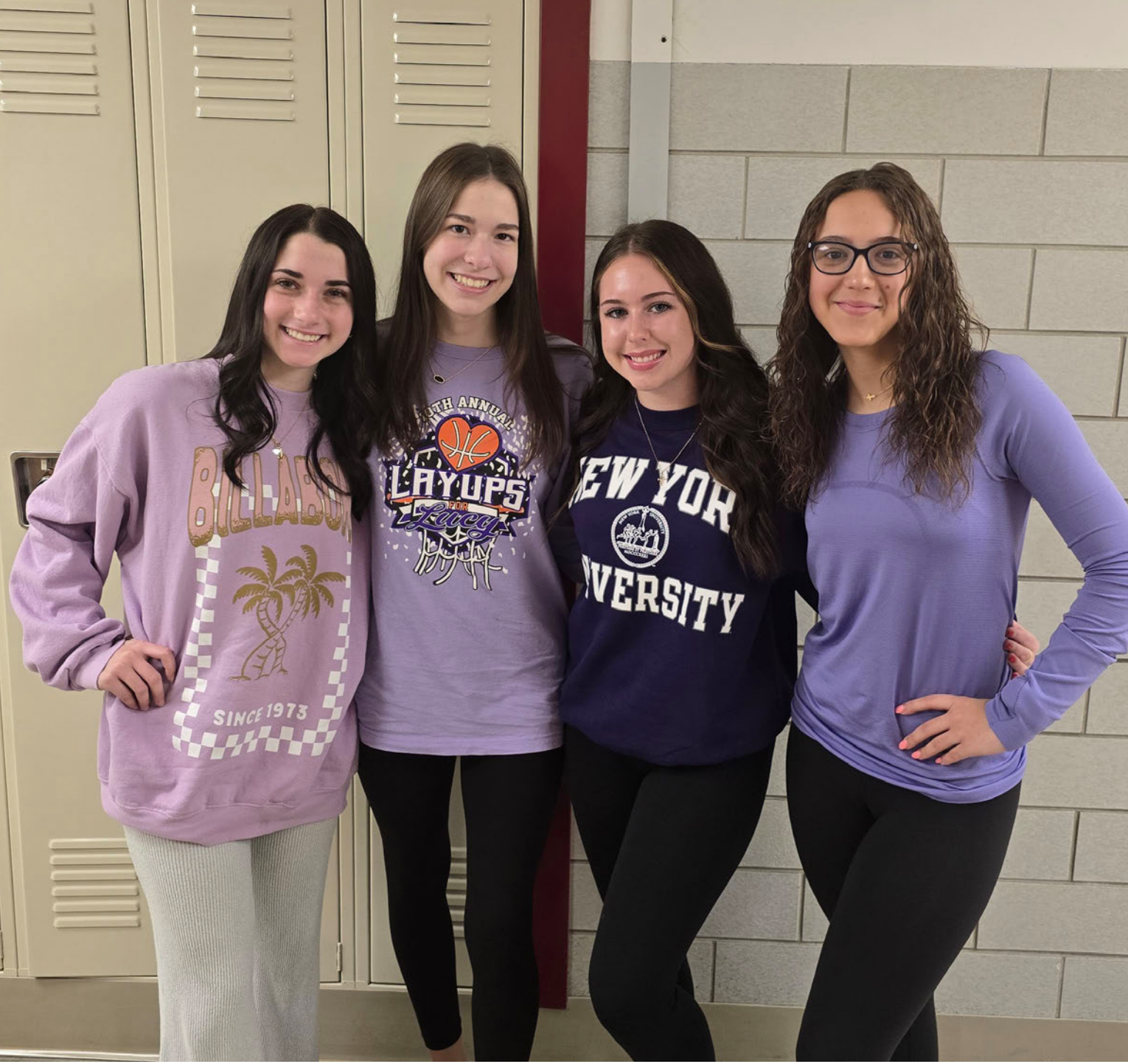
The EAWCP provided epilepsy awareness bracelets to and encouraged schools and companies throughout western and central Pennsylvania to host epilepsy awareness days. Several schools participated, including these students from Neshannock Township School District.