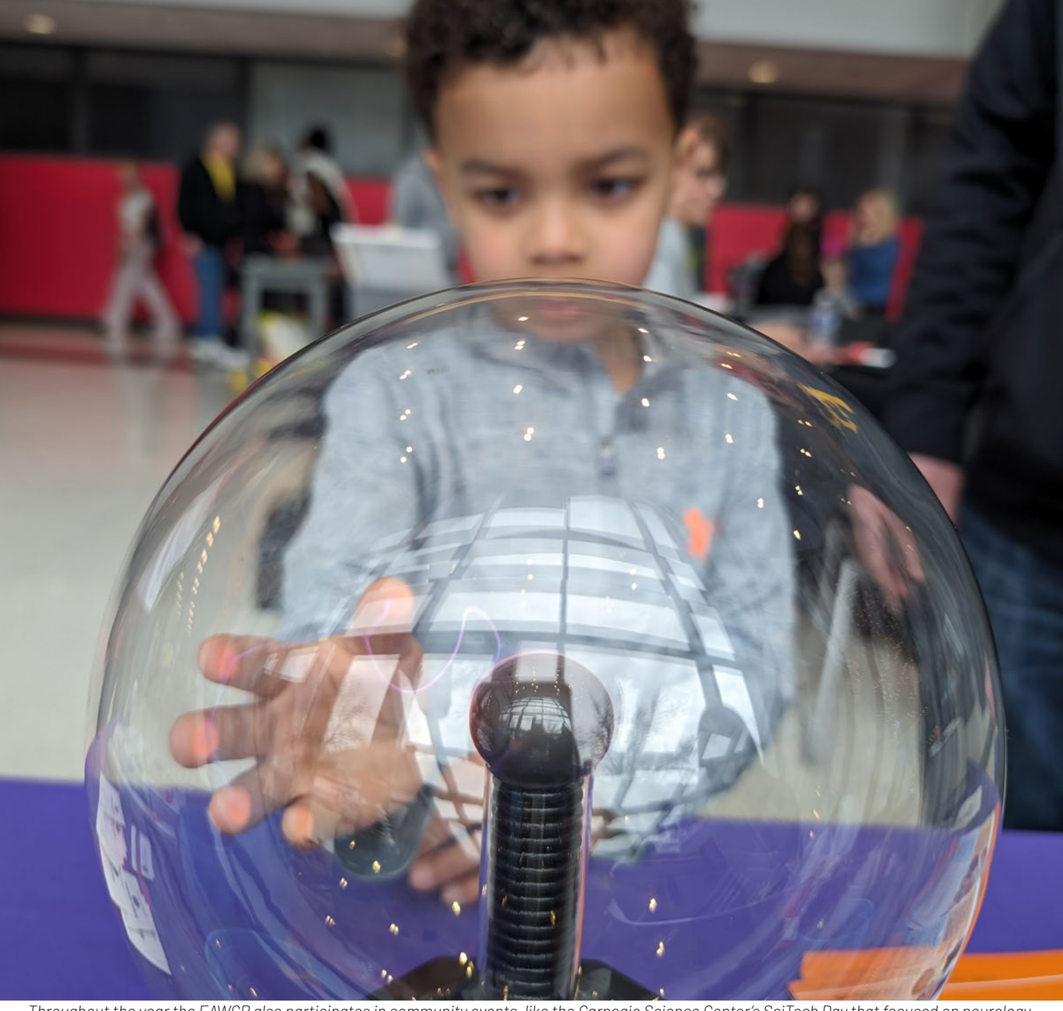
Throughout the year the EAWCP also participates in community events, like the Carnegie Science Center's SciTech Day that focused on neurology. At our resource table, we used a plasma ball to demonstrate what happens in the brain during a seizure.