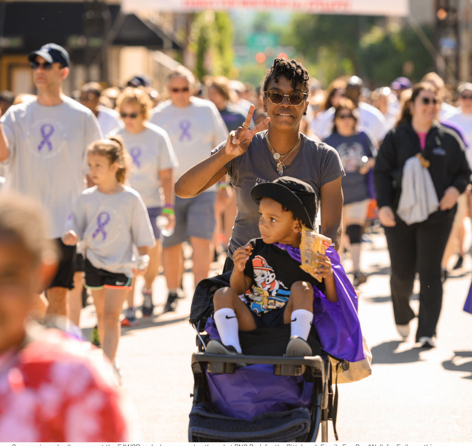
Summer is run/walk season at the EAWCP and a huge crowd gathered at PNC Park for the Pittsburgh Family Fun Run/Walk for Epilepsy this year.