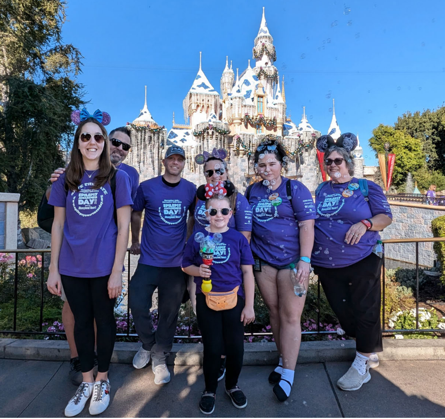
In November, three local families traveled to California for the annual Epilepsy Awareness Day and Expo at Disneyland, a three-day event filled with educational presentations, various booths, and an awareness day in Disneyland Park.