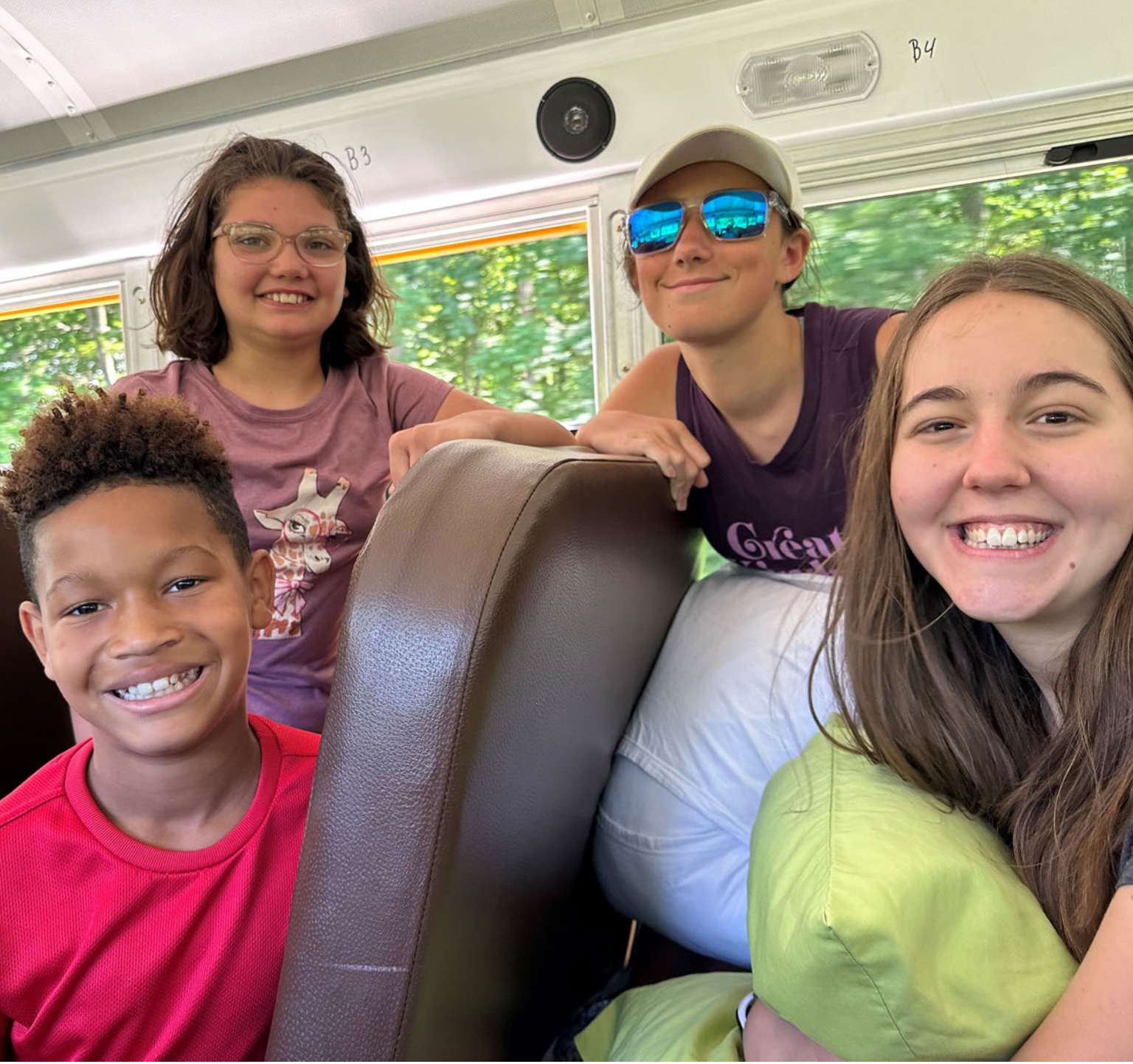
Camp Frog campers were excited to board the bus to camp this year, as Camp Frog resumed its schedule as a full week of sleep away summer camp for the first time since 2019.